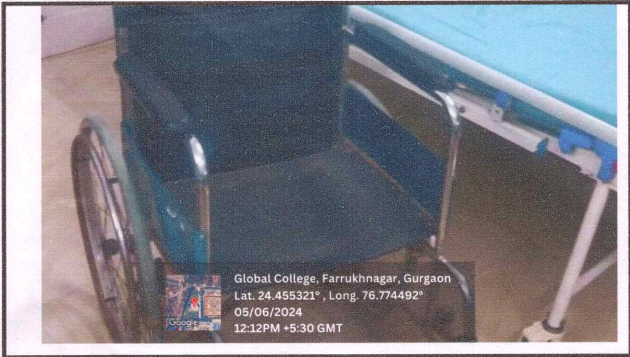
Photograph of Wheel Chair in the campus

5. Disabled Friendly Washroom: GGCP has the disabled friendly washroom for providing support to the needy students.