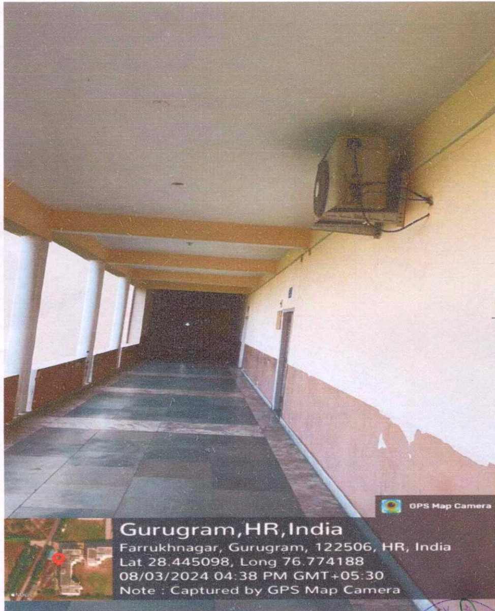
Photograph of Corridors

GGCP ensures corridors are wide enough and unobstructed to facilitate easy passage, especially for wheelchair users. The preferred width is such that it allows two wheelchairs to pass.