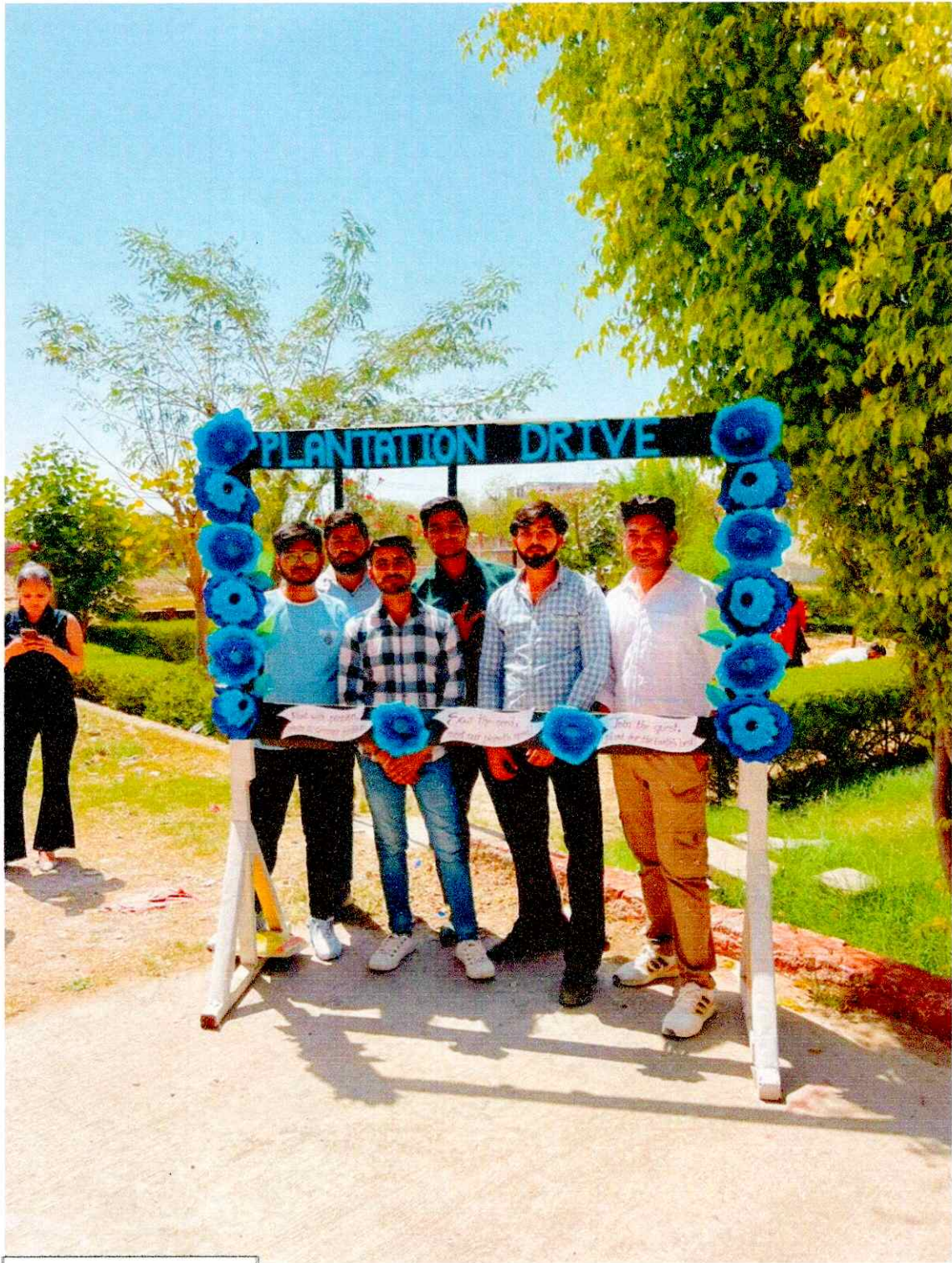
Tree Plantation Drive