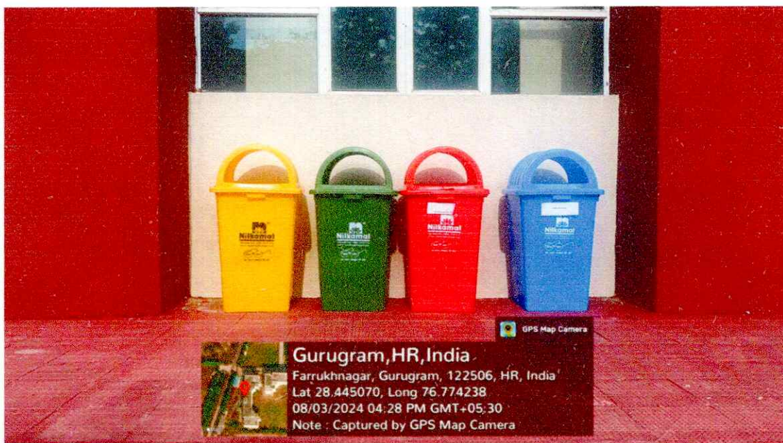
Different coloured dustbins used for Segregation of Solid Waste