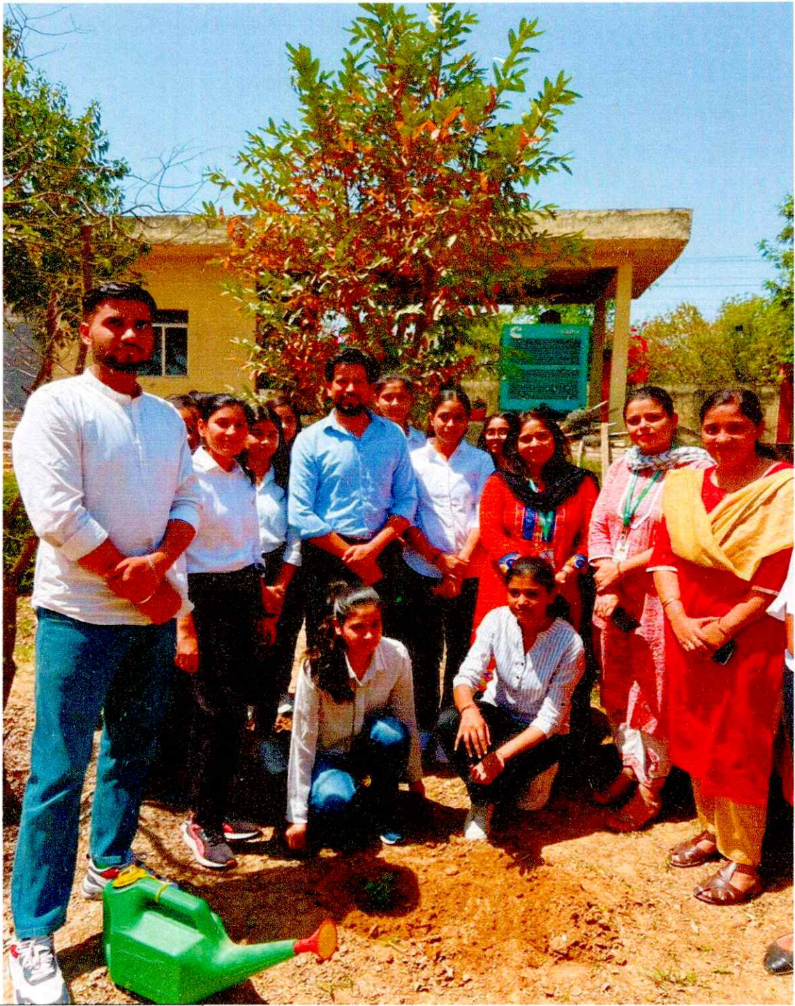
Tree Plantation Drive