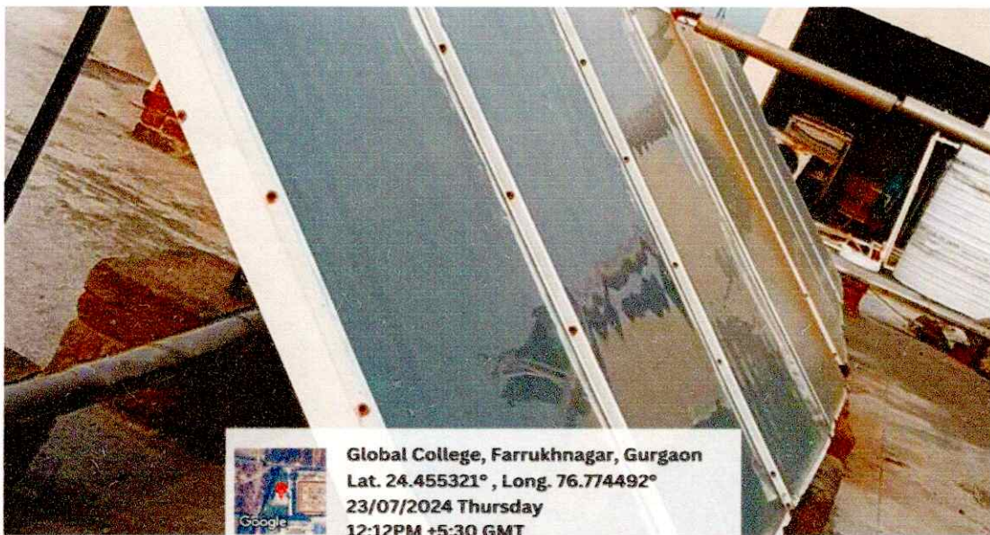
Energy Conservation Measures