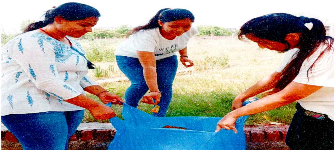
Activity under Plastic free campus drive