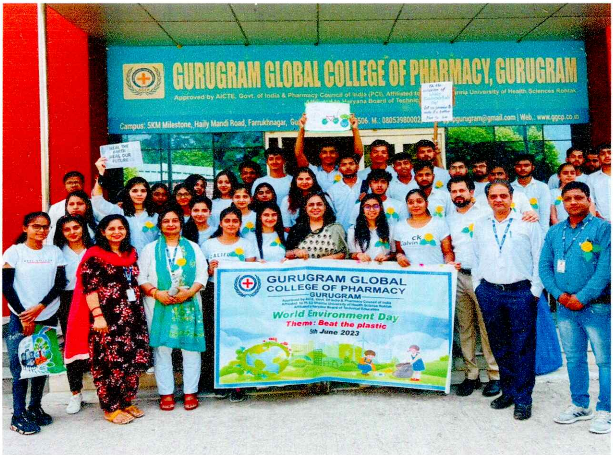
Platic Free Campus Drive