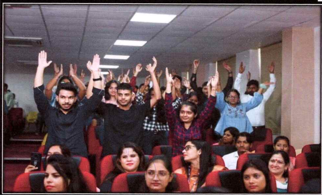
Session on Human Value and Ethic 20 th Nov 2019