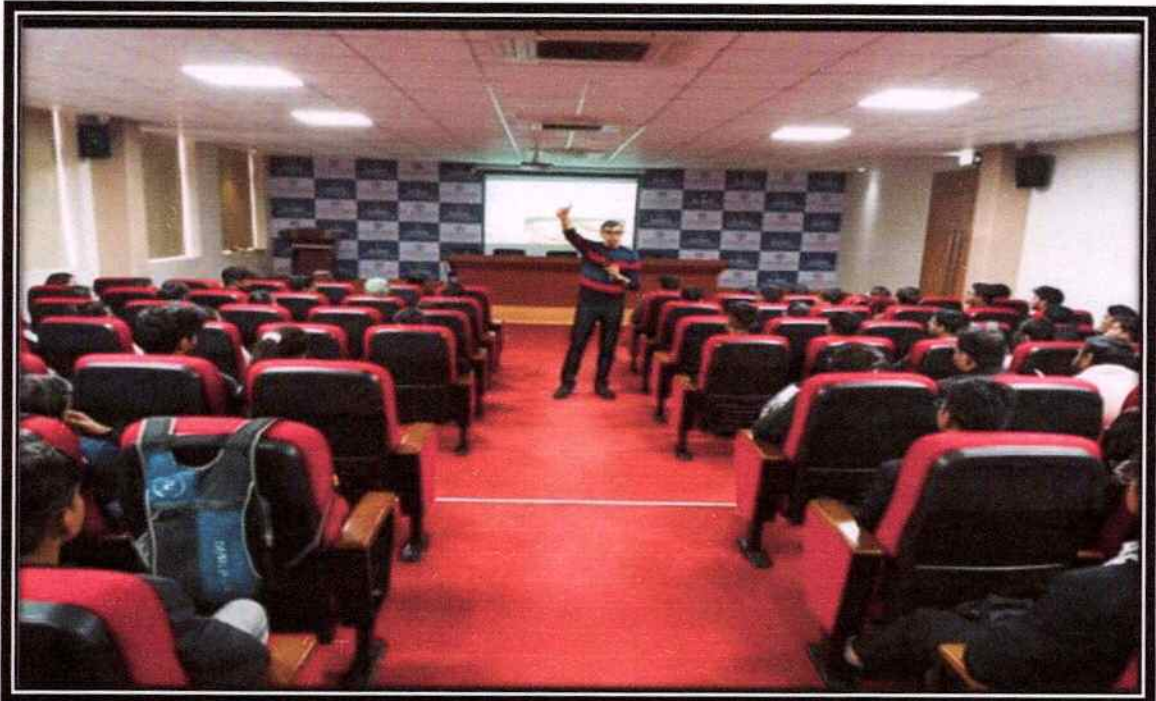
Session on Soft skill to improve self personality 18 th June 2019

Approved by AICTE, Govt. Of India & Pharmacy Council of India Affiliated to Pt. B.D Sharma University of Health Science Rohtak Affiliated to Haryana Board of Technical Education