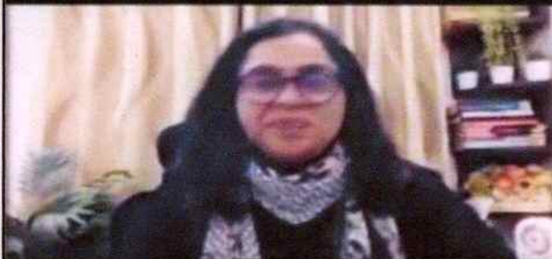
Gurugram Global College Of P...