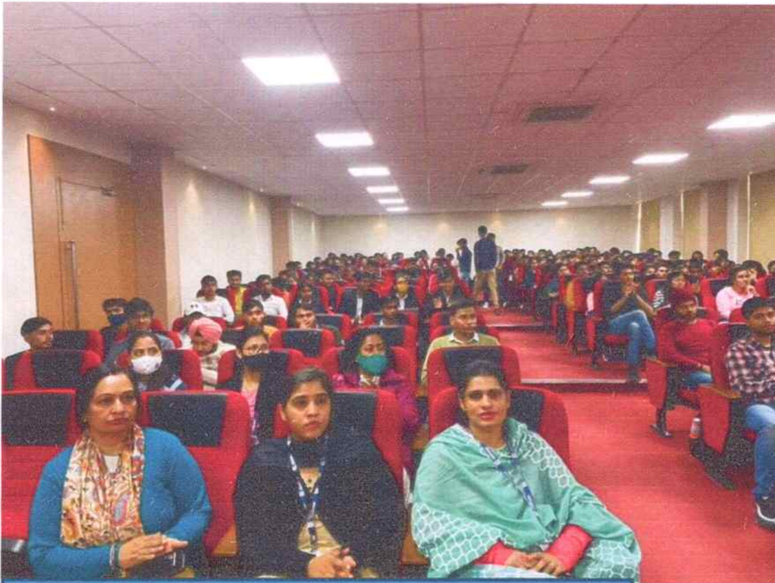
Session on How to Improve the Self Personality-17th Jan 2020

Approved by AICTE, Govt. Of India & Pharmacy Council of India Affiliated to Pt. B.D Sharma University of Health Science Rohtak Affiliated to Haryana Board of Technical Education