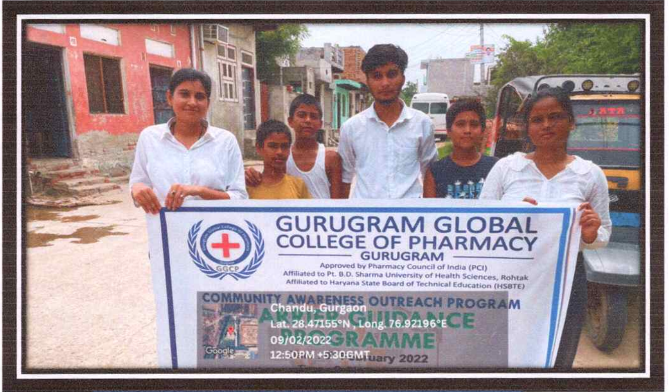
“Career Guidance Programme”- 09 th February 2022