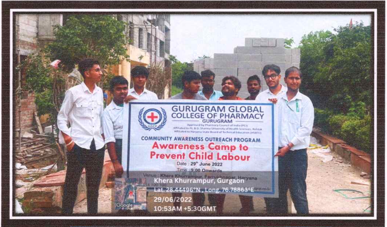
"Awareness Camp to Prevent Child Labour"- 29 th June 2022