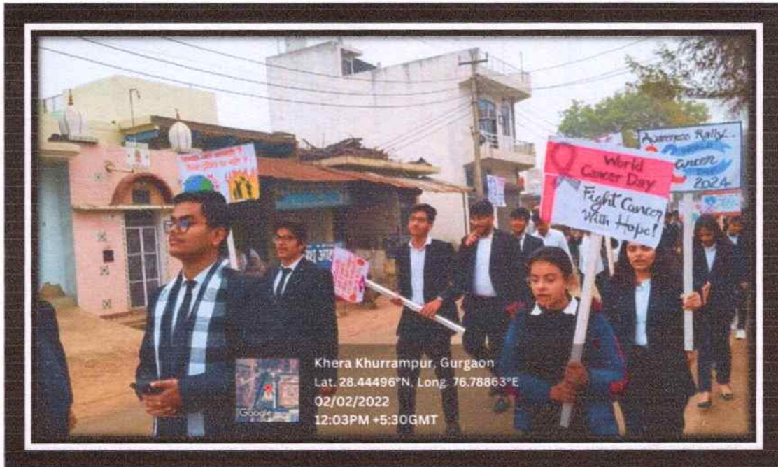
“World Cancer day”-2 nd February 2022