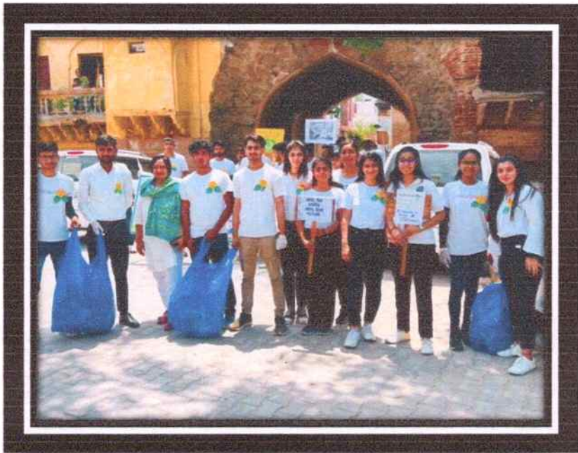
"Awareness Walk on Plastic free Environment"-15 th Jan 2020