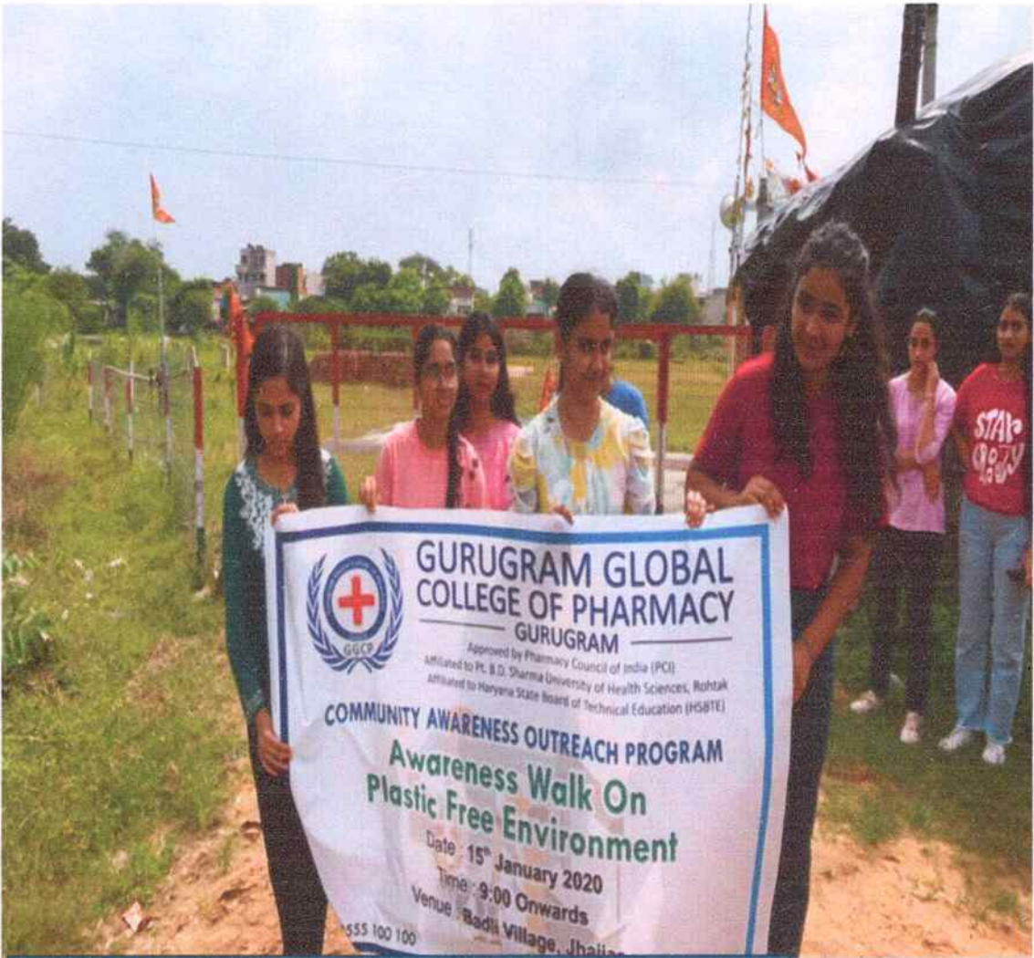
Awareness Walk on Plastic Free Environment-15 th January 2020