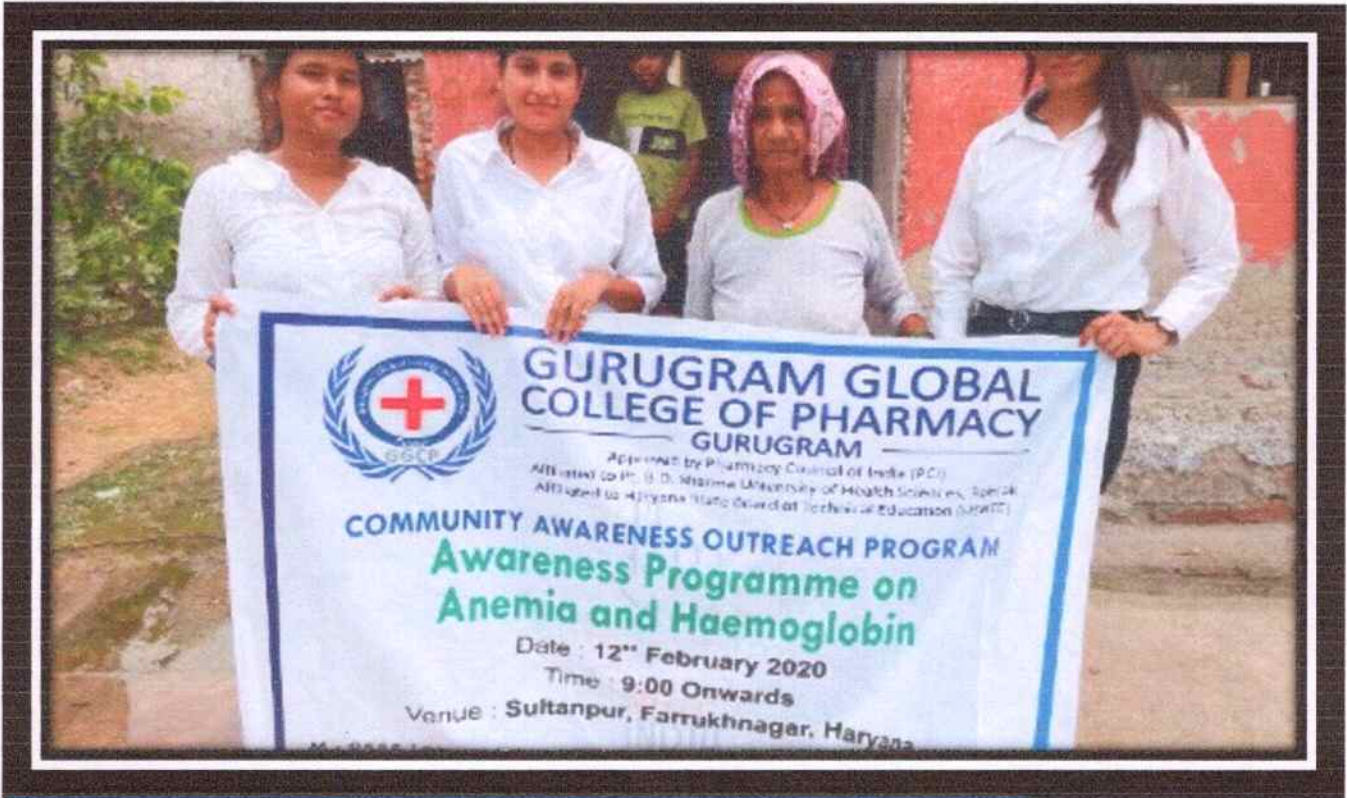
"Awareness Programme on Anemia & Haemoglobin" - 12 th February 2020