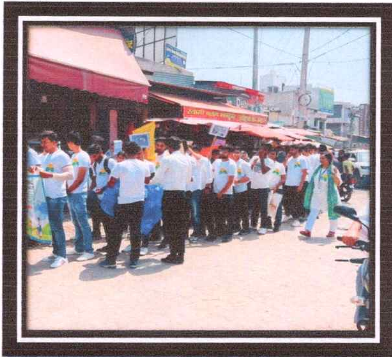
"Awareness Walk on Plastic free Environment"-15 th Jan 2020