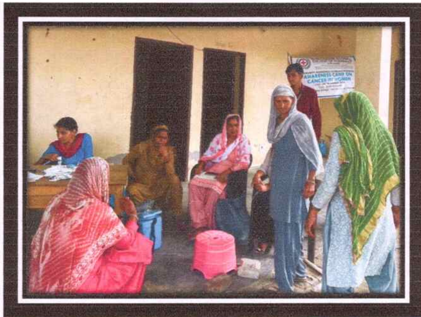
"Awareness Camp on Cancer in Women"-20 th November 2019