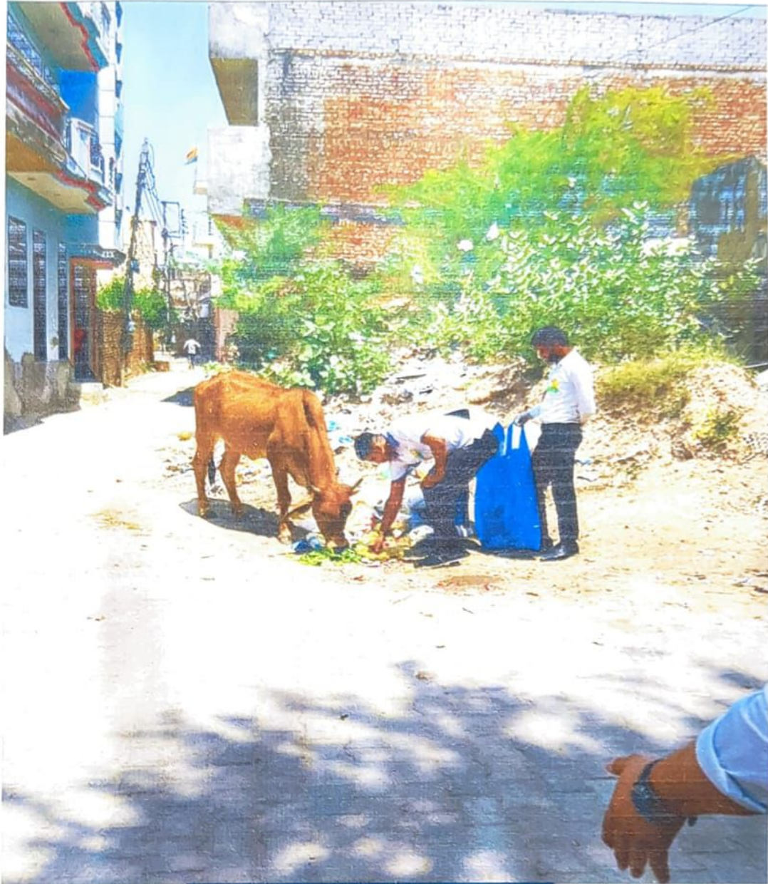
Plastic Clean-up drive-12 th October 2018