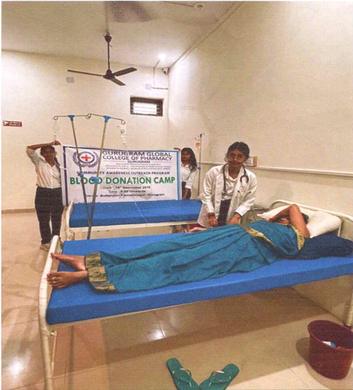
Blood Donation Camp – 19 th December 2018