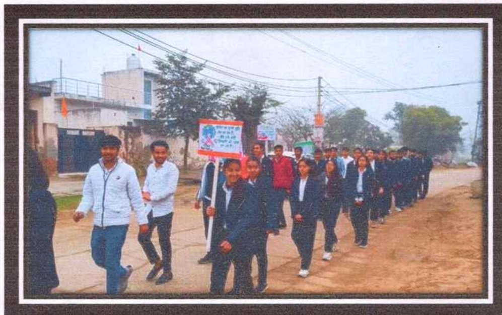
"Camp on Women Safety & Security"-29 th August 2018