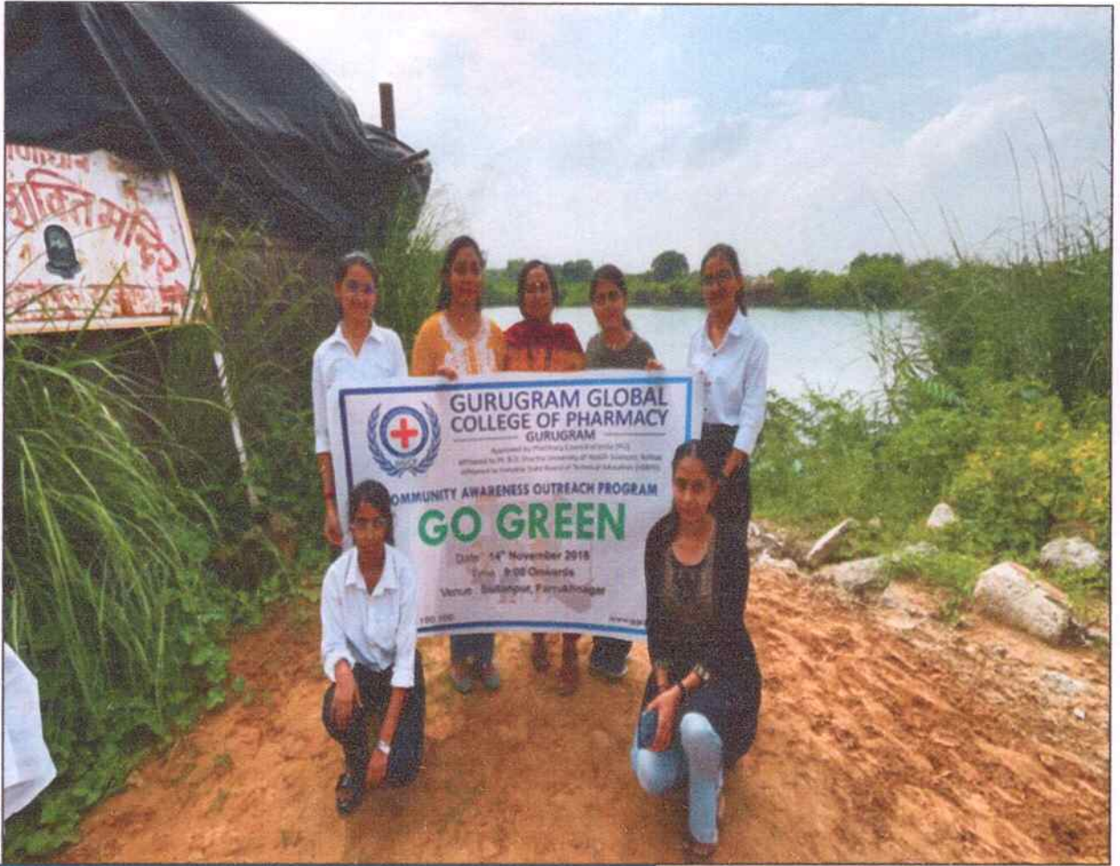
Go Green-14 th November 2018