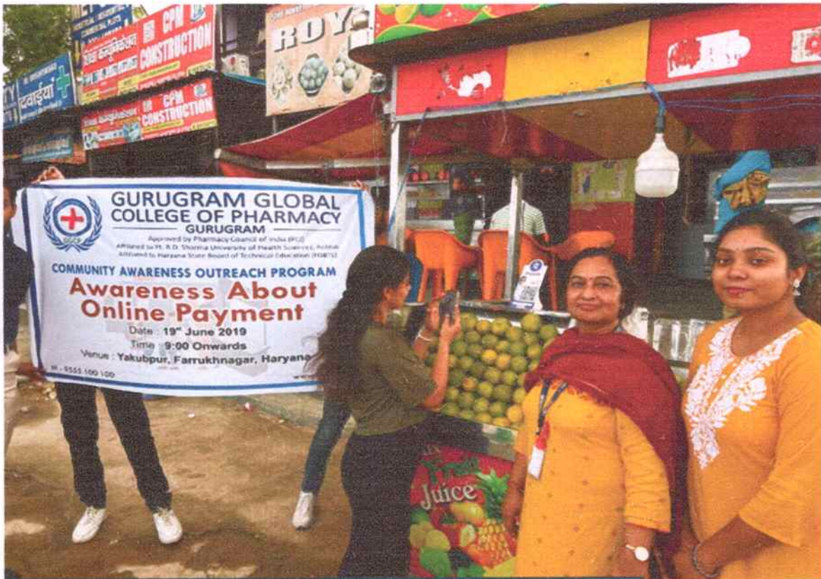
Awareness About Online Payment-19 th June 2019