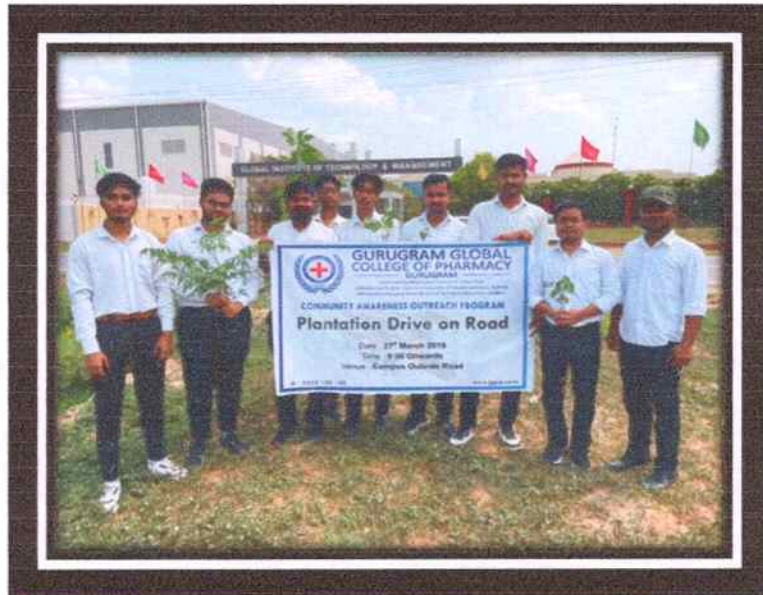
“Plantation Drive”-27 th March 2019