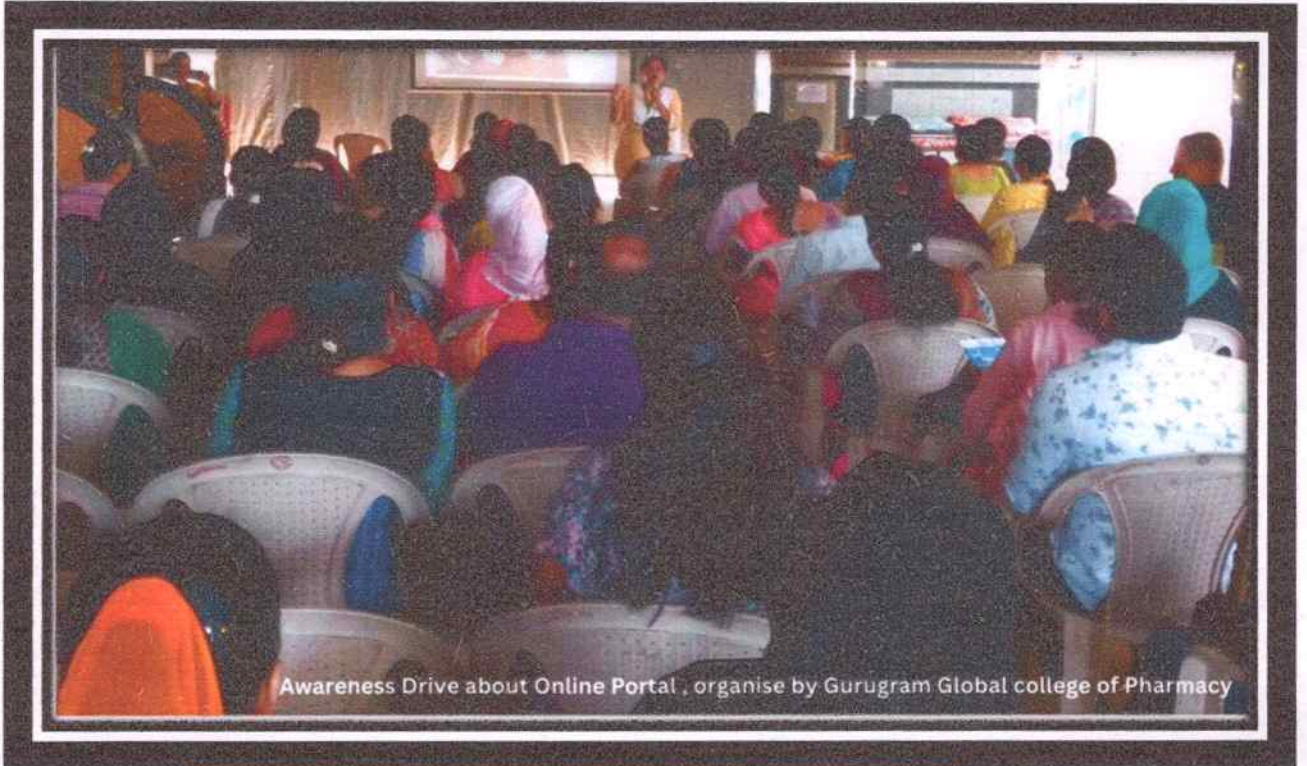
Awareness Drive about Online Portal , organise by Gurugram Global college of Pharmacy