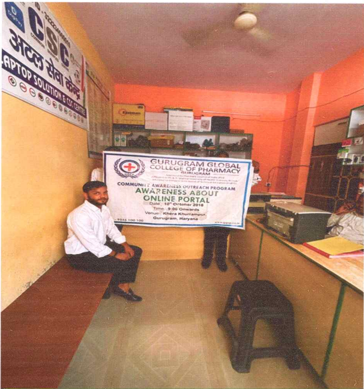
Awareness About Online Portal-10 th October 2018