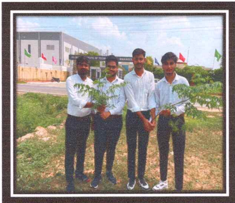
“Plantation Drive”-27 th March 2019