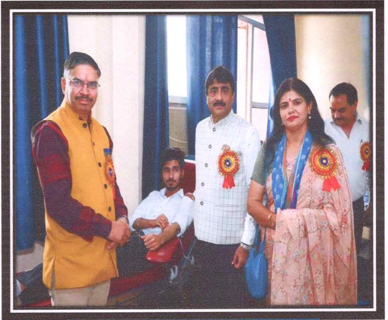
“Blood donation Camp”-19 th December 2018