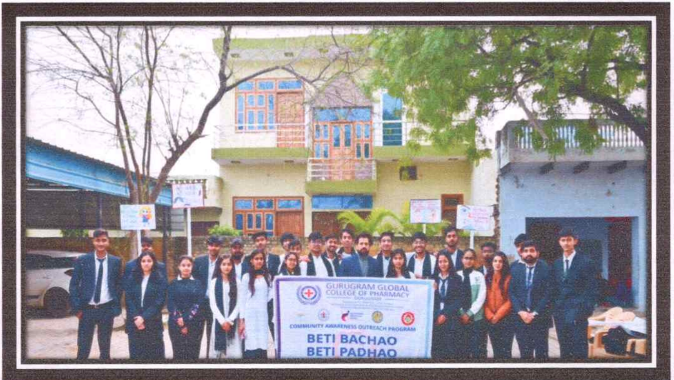
Beti Bachao Beti Padhao- 22 nd August 2018