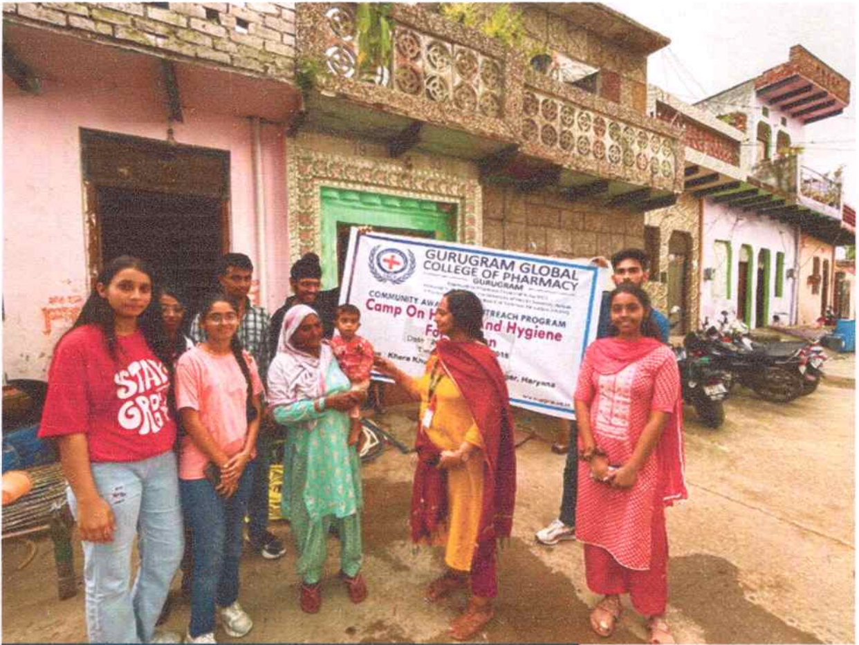
Camp on Health & Hygiene for Women-26 th September 2018