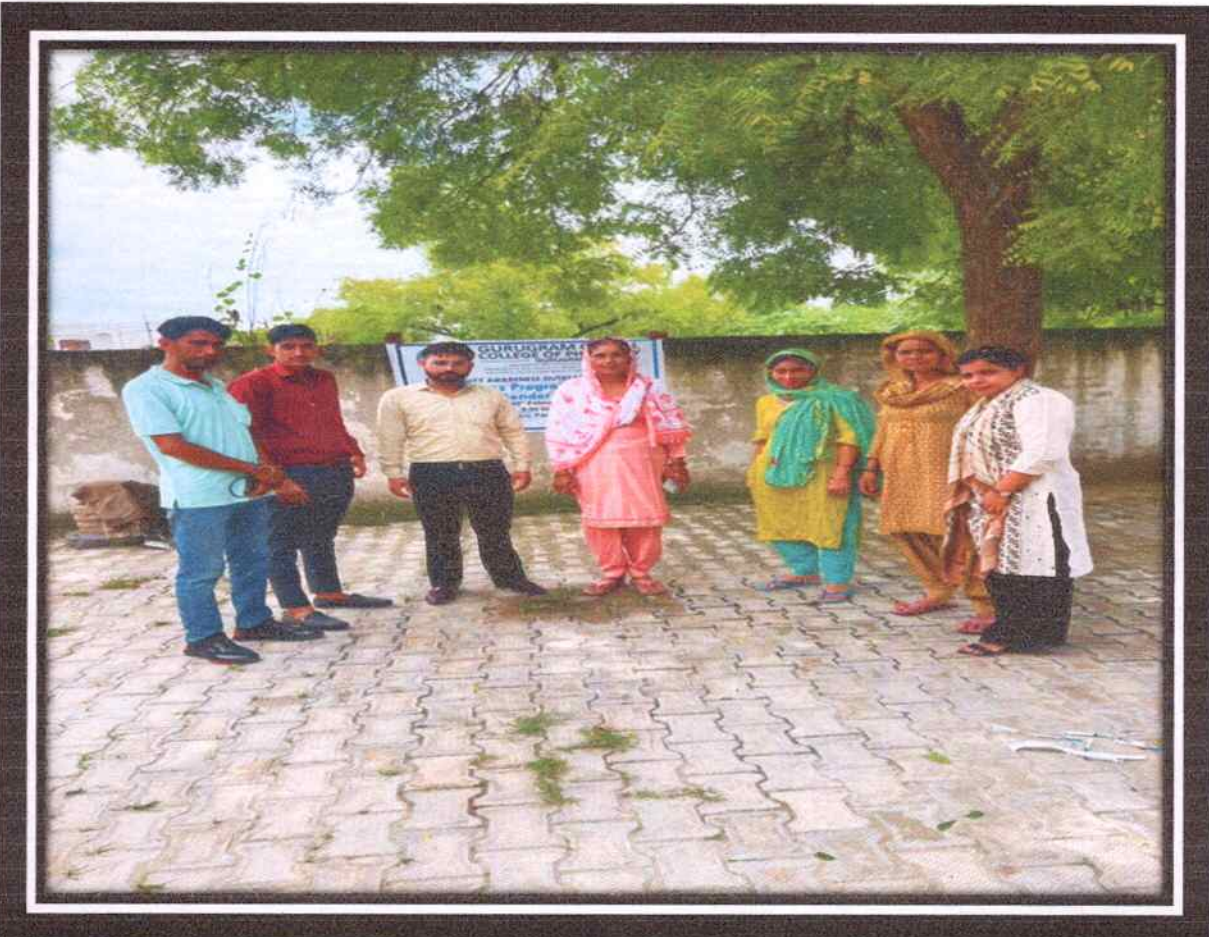
Awareness Programme Under the theme Gender Based Violence-20 th February 2019

Global College of Farrukh Quetta [Signature]