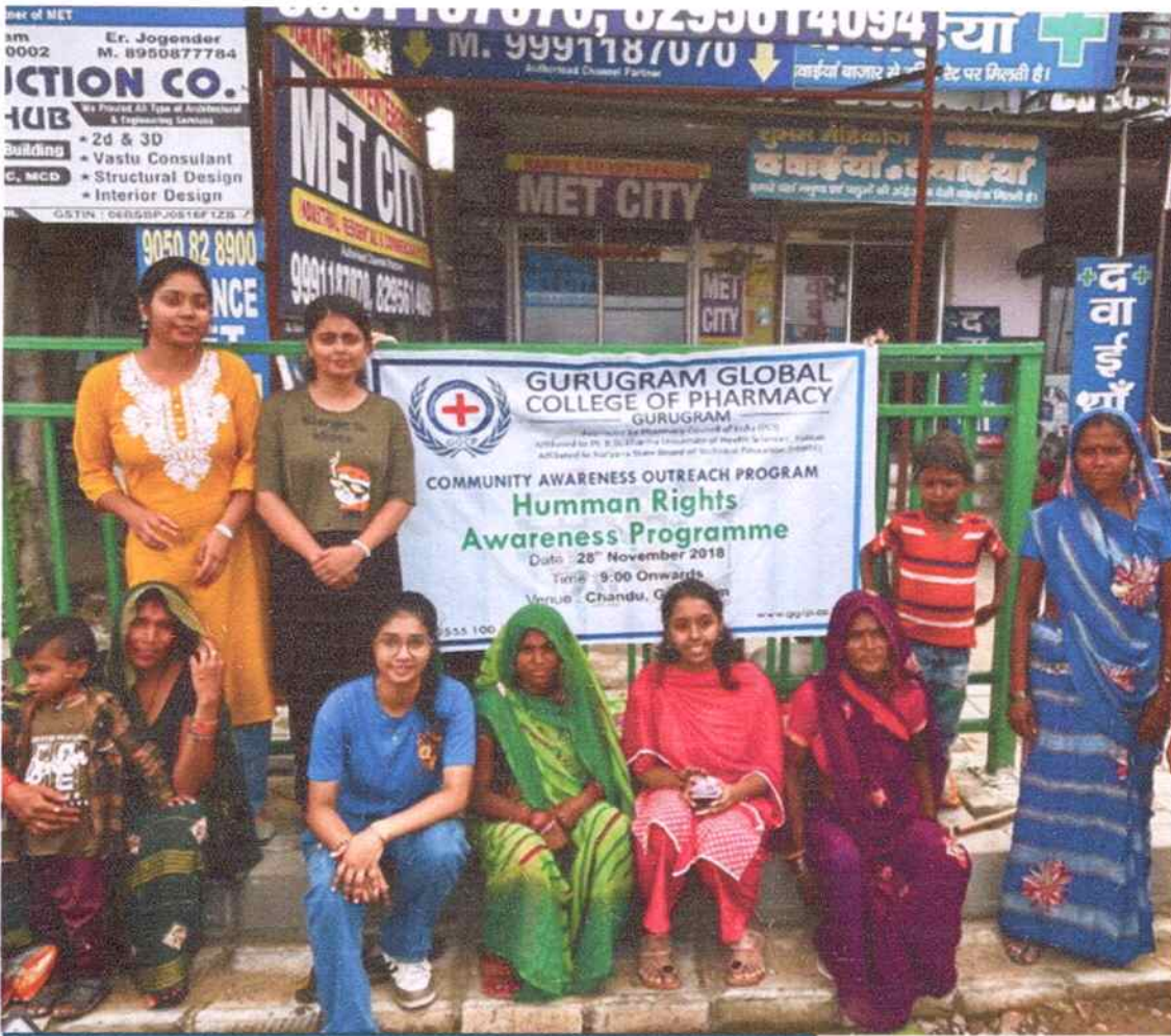
Human Rights Awareness Program-28 th November 2018