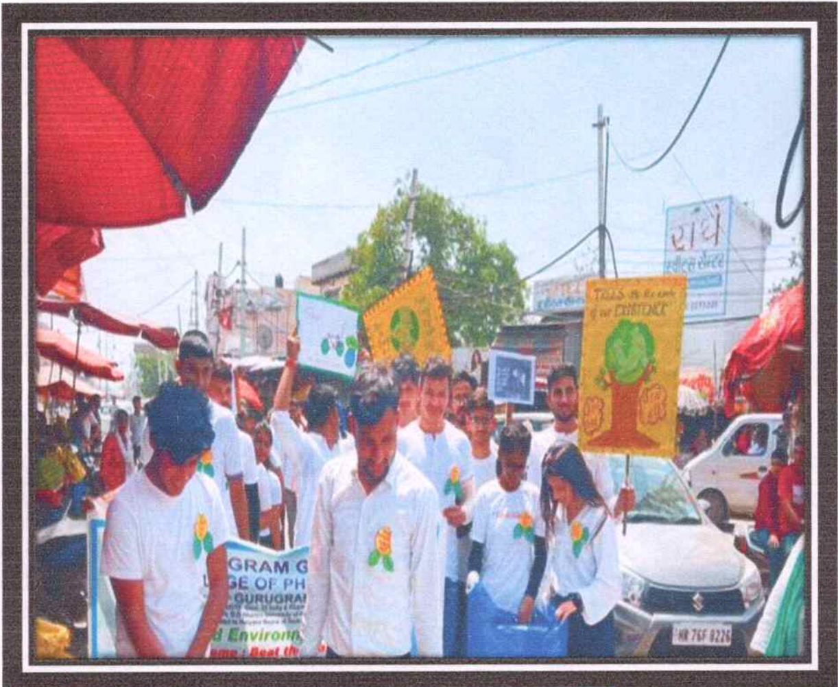
Camp on Save Environment- 08 th August 2018