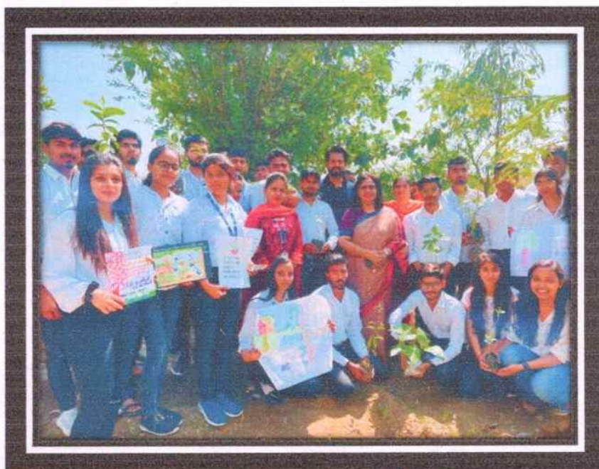
Go Green- 14 th November 2018