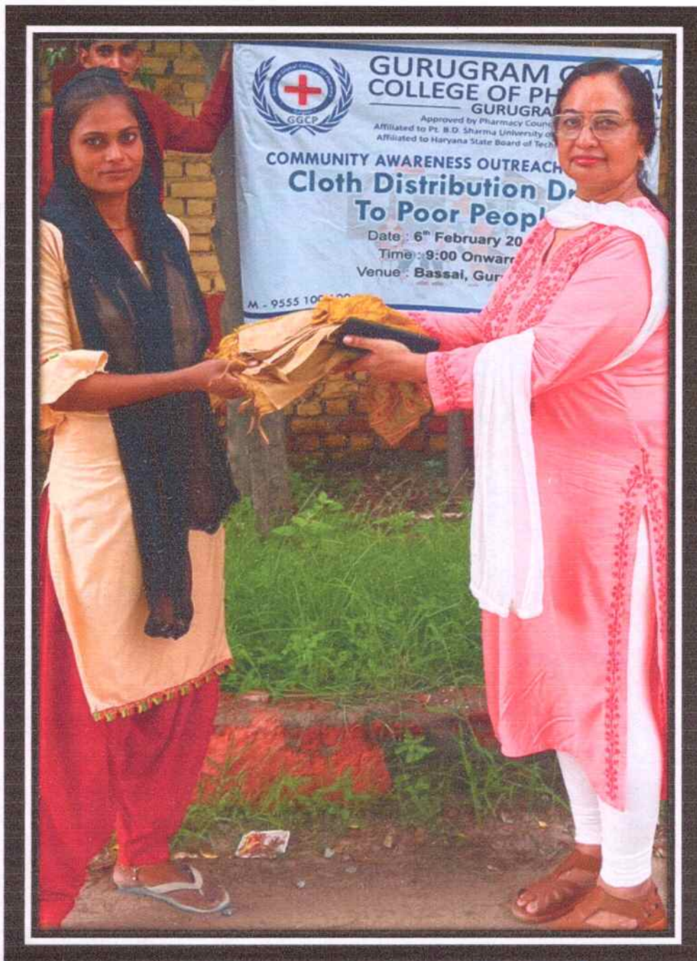
Cloth Distribution Drive-6 th February 2019