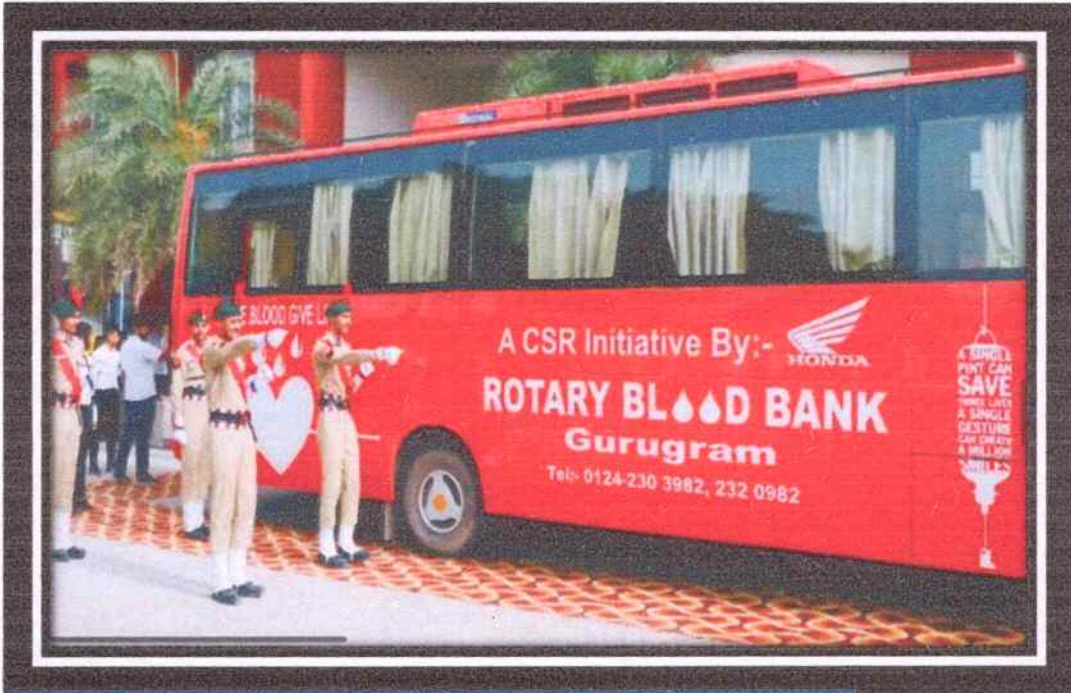
“Blood Donation Camp”- 22 nd November 2018