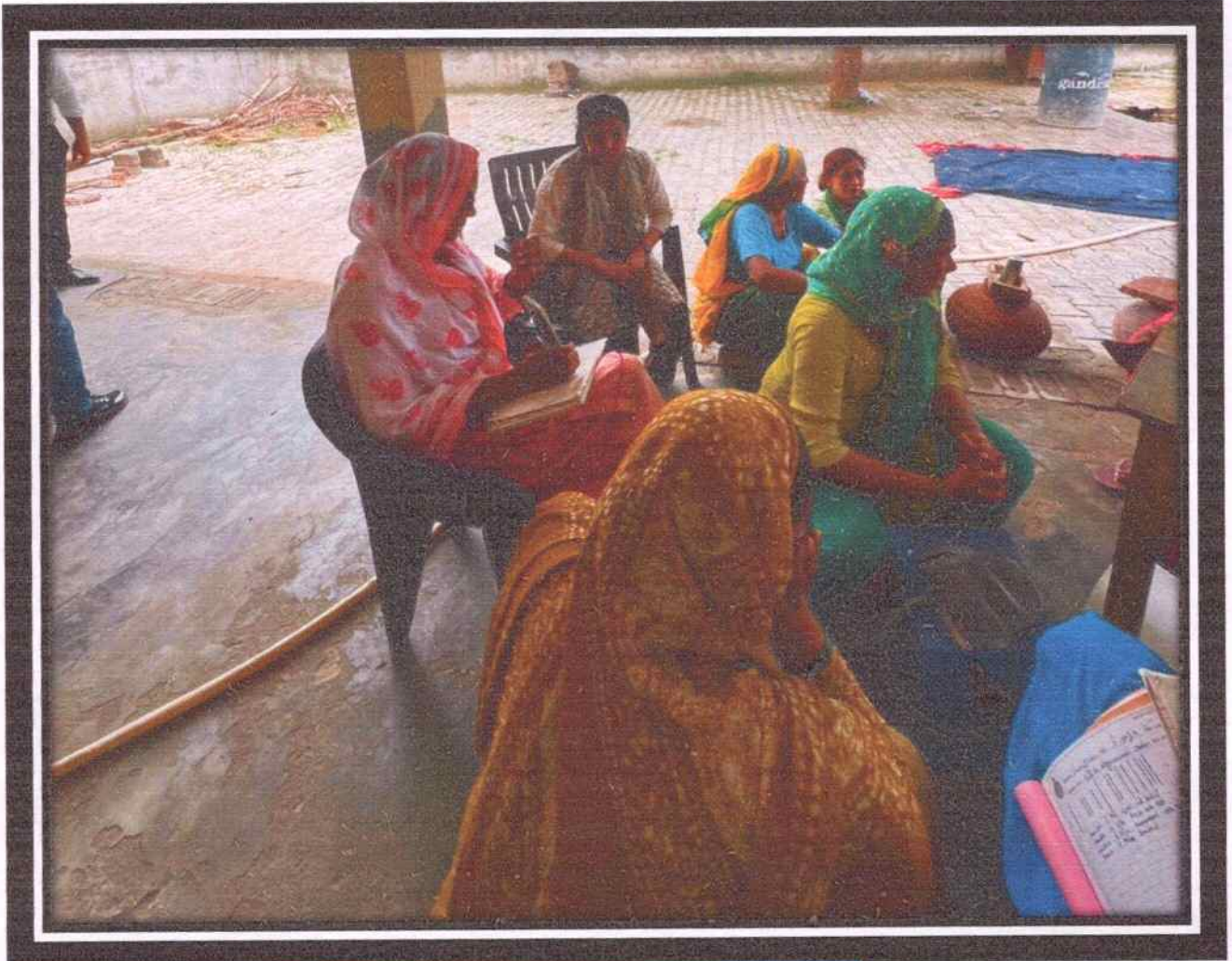
“Women Health & Hygiene for Women”-26 th September 2018