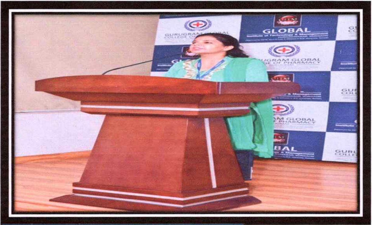
Mixed Methods Research Colloquium-4 th November 2019