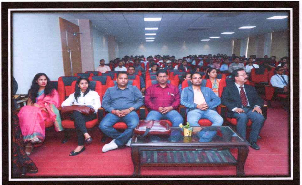
Patent Powerhouse: Maximizing IPR in Pharma-16 January 2020