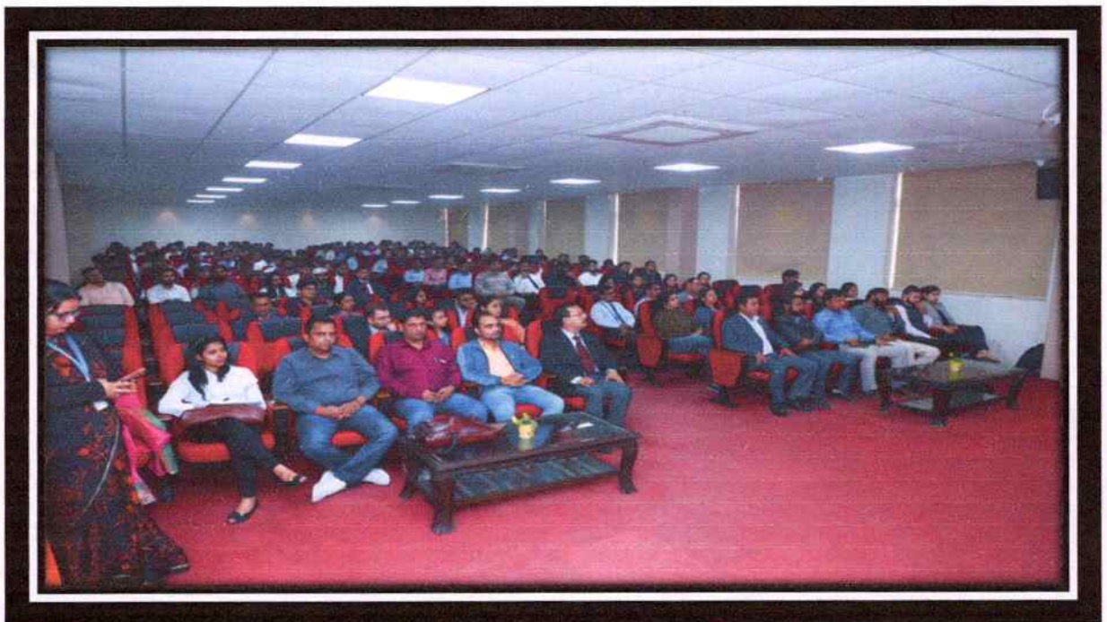
Patent Powerhouse: Maximizing IPR in Pharma-16 January 2020