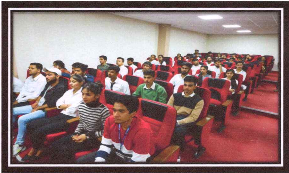
Sampling Techniques and Strategies Forum-25 th November 2019