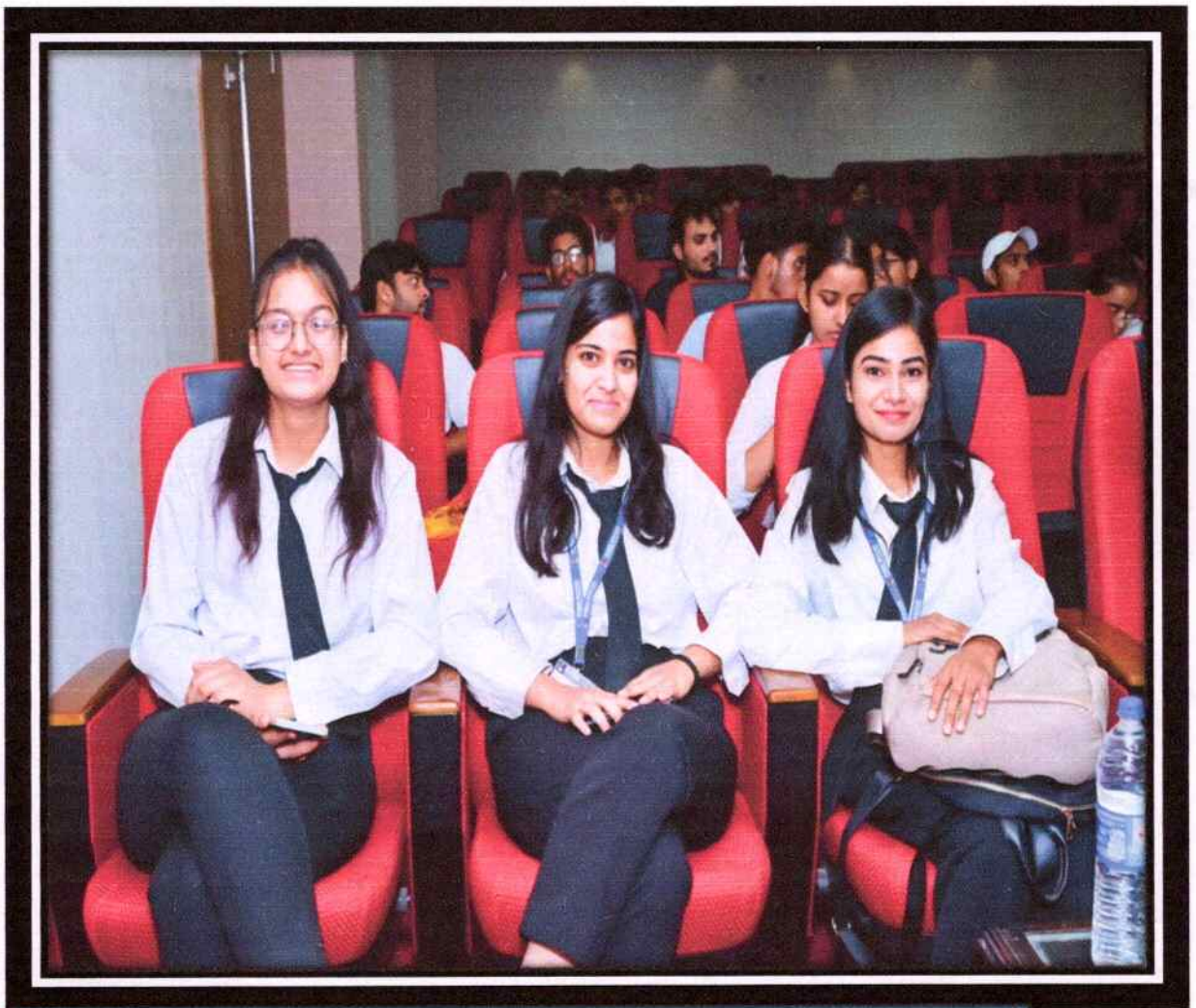
Innovate & Protect Strategies for Pharma IPR Management-11 th March 2020