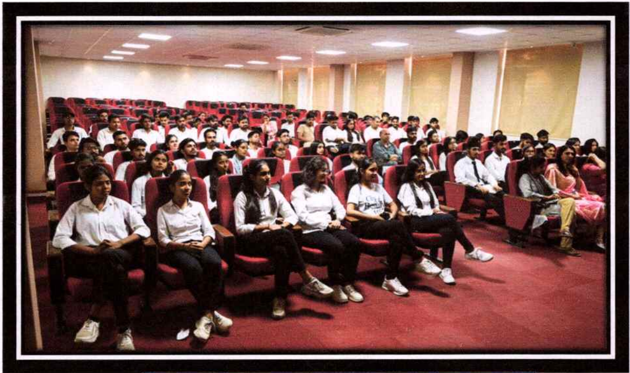
Survey Design and Implementation-30 th September 2019