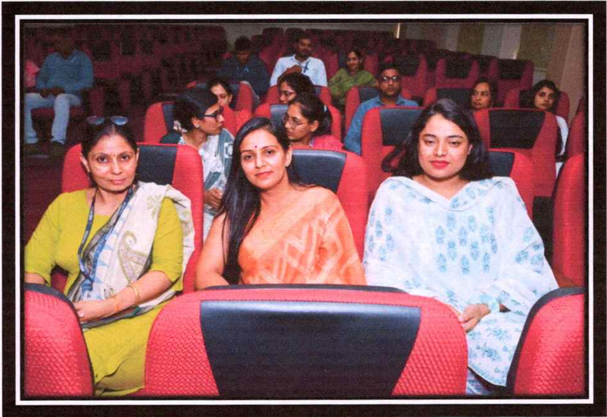
Mixed Methods Research Colloquium-4 th November 2019