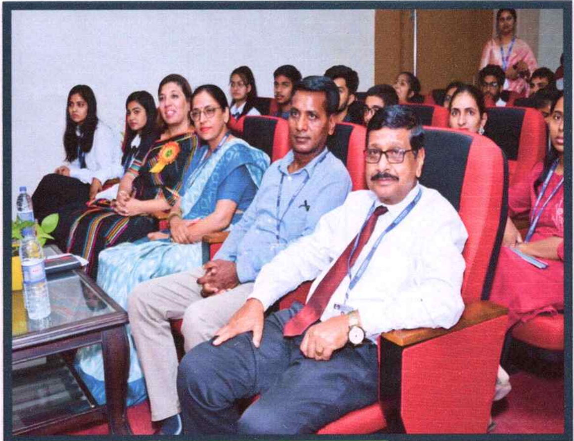
Experimental Design Symposium-10 th September 2019