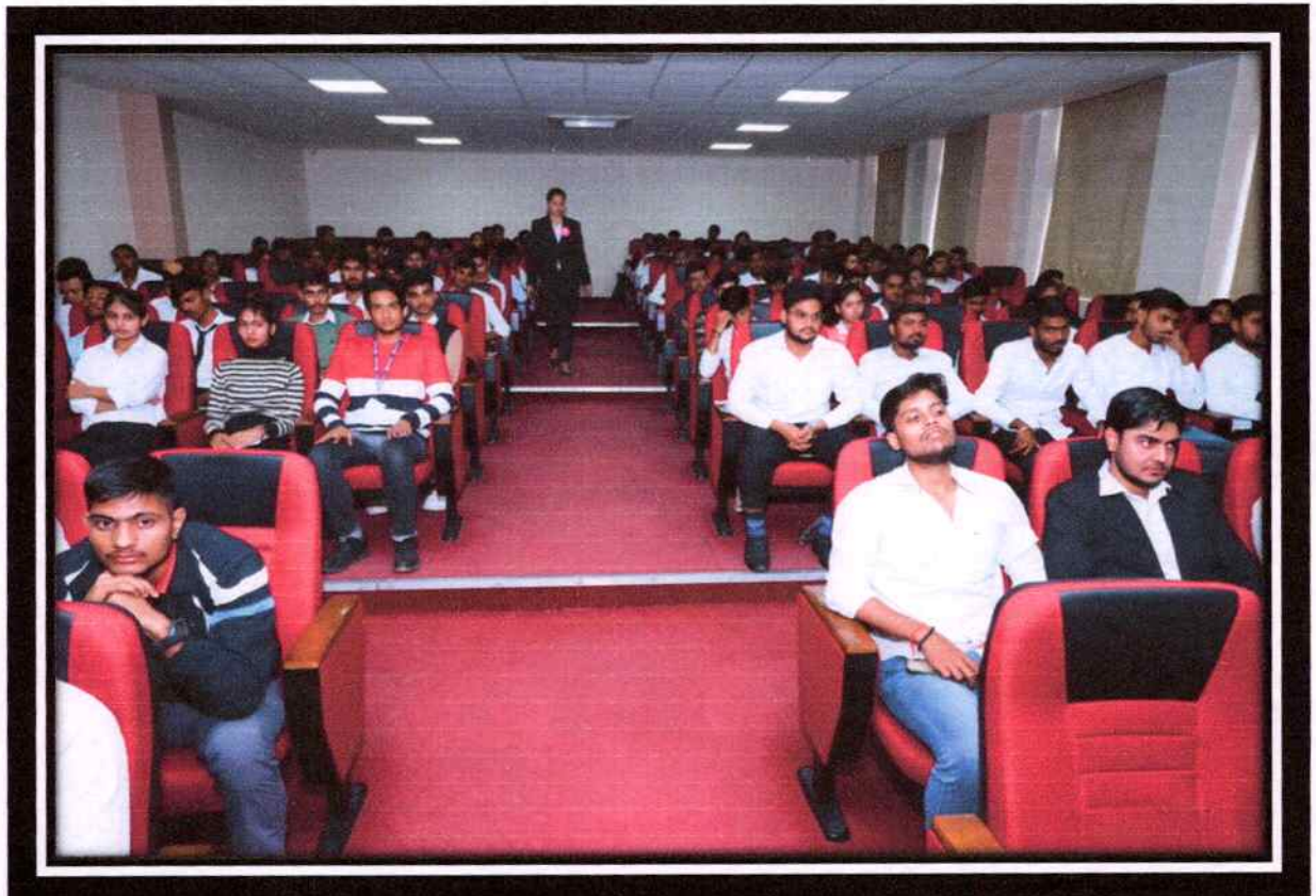
Ethnographic Research Techniques-23 rd December 2019