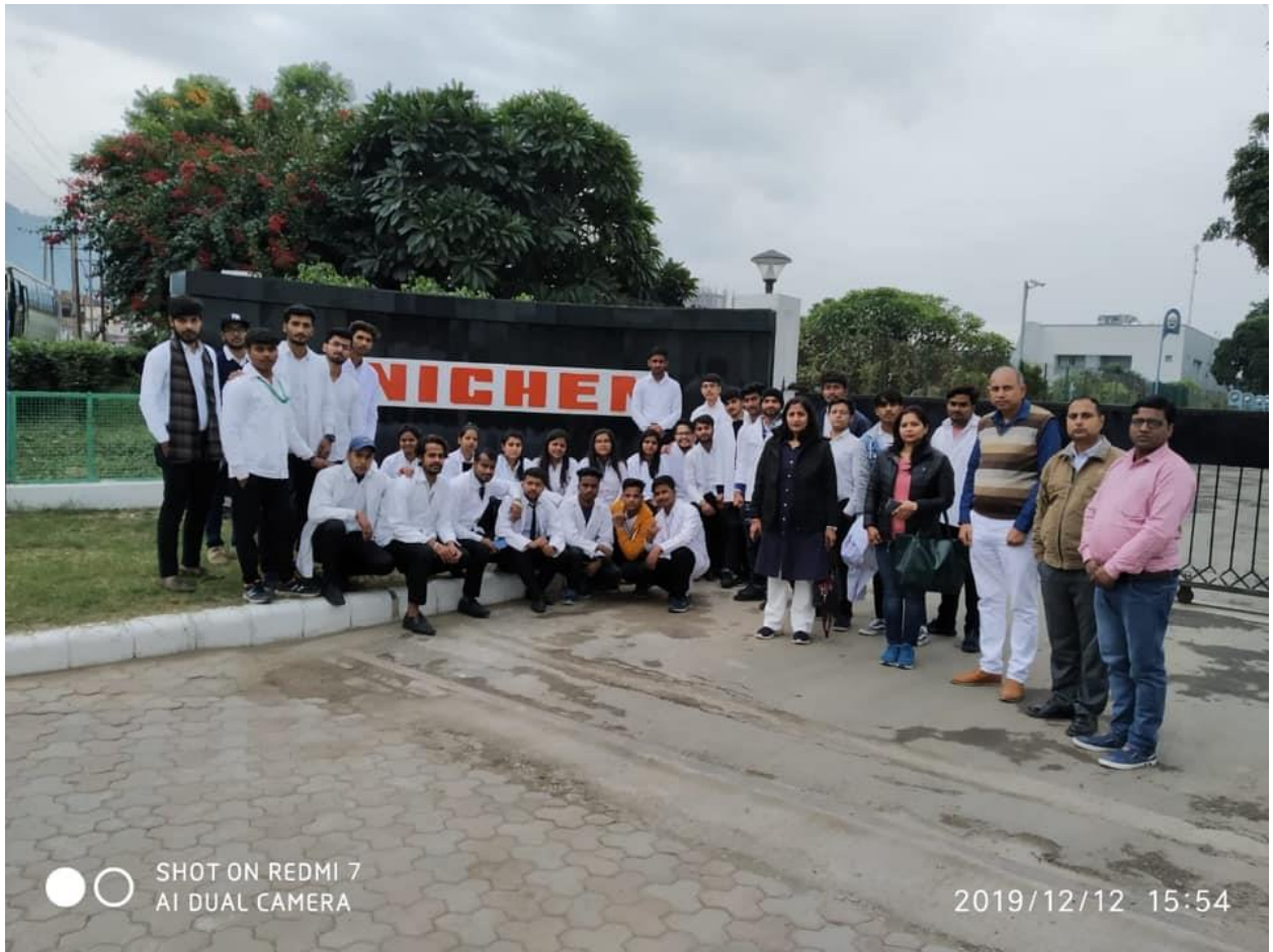
Industrial Visit at Unichem, Baddi

Approved by AICTE, Govt. Of India & Pharmacy Council of India Affiliated to Pt. B.D Sharma University of Health Science Rohtak Affiliated to Haryana Board of Technical Education